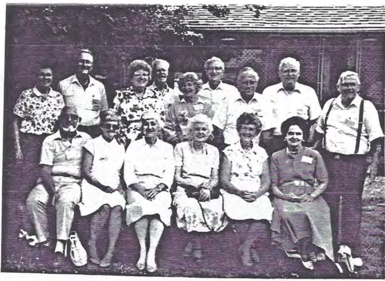
1991 SCHUTZ REUNION