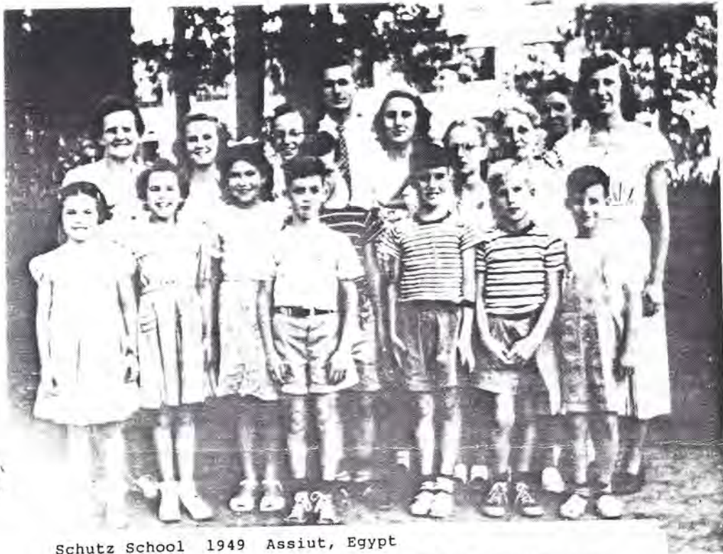
Schutz School 1949 Assiut, Egypt